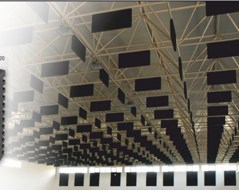
Image of 120x60cm models Ref.:WBF120 and Ref.:WLS120 (on the left) and Ref.:WBF120 applied (ambient image).