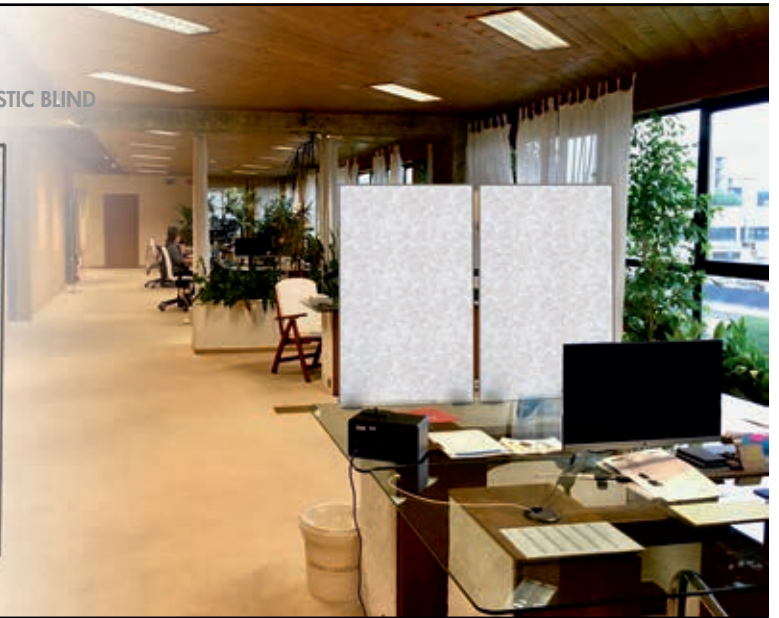
Image of 200x120cm models Ref.:WPTW200 and WPT200 (on the left) and Ref.:WPT200 (ambient image).