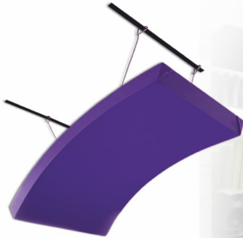
Image of Mellowcloud® ABS model Ref..MELABS applied (ambient image).