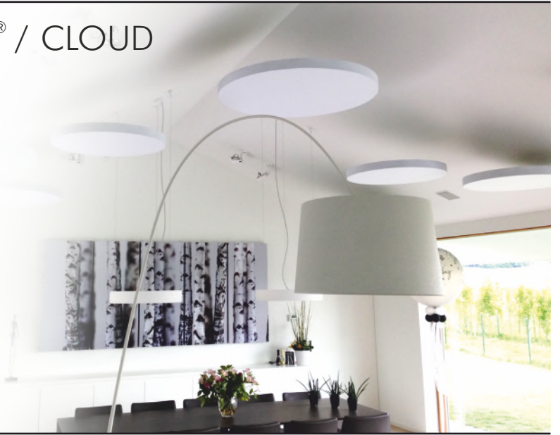
Image of 180x90cm, of the new 90x90cm cloud shape, the 90cm circular panel and 90x30cm model Ref.:LIG180, LIG090, LIGR090 and LIG030 (on the left) and Ref.:LIGR090 model applied (ambient image).