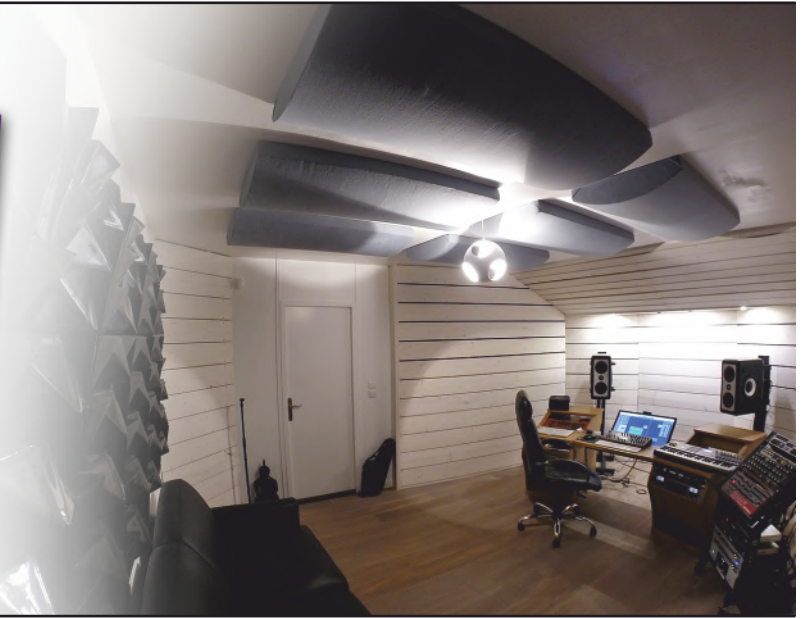
Image of 60x60cm models Ref.:EBY060 (on the left) and Ref.:EBY120 (ambient image).