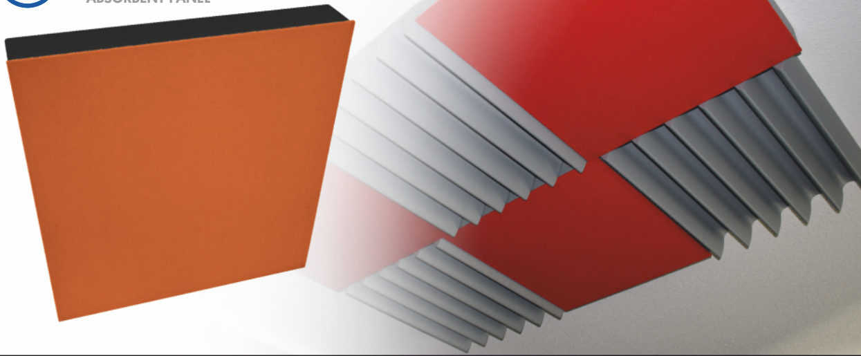
Image of 60x60cm model Ref.:CAM060 (on the left) and Ref.:CAM060 applied (ambient image).