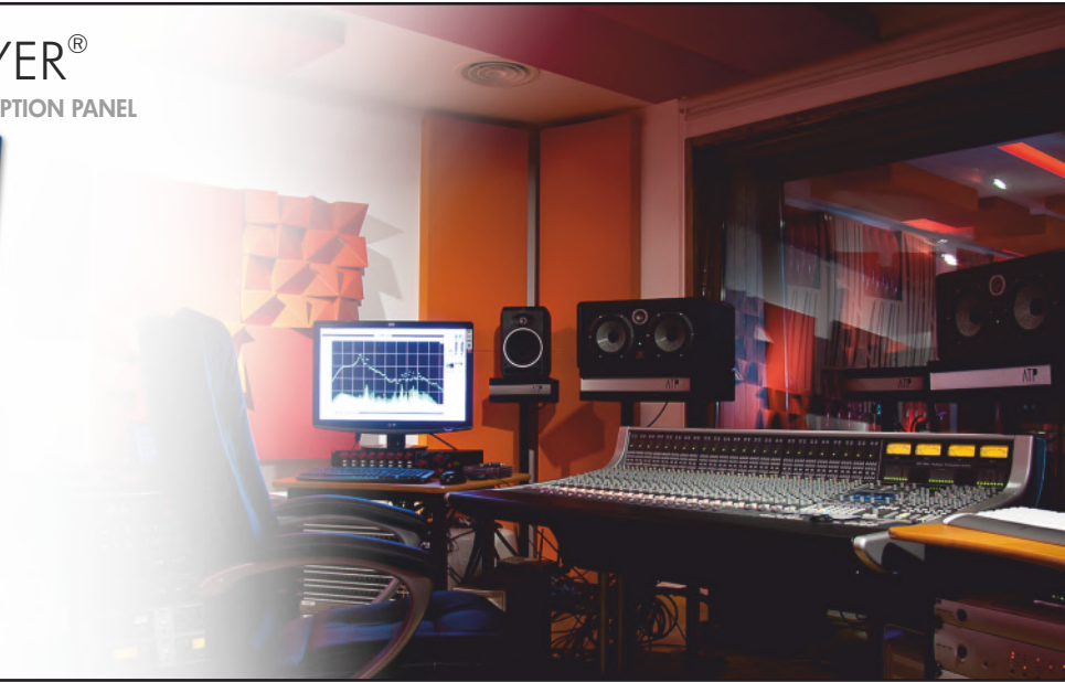
Image of 120x60cm model Ref.:BXL120 (on the left) and Ref.:BXL120 (ambient image).