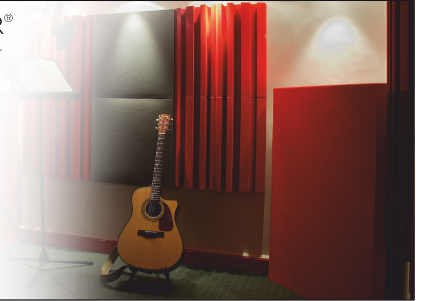
Image of 120x60cm model Ref.:BC0120 (on the left) and Ref.:BC0120 (ambient image).